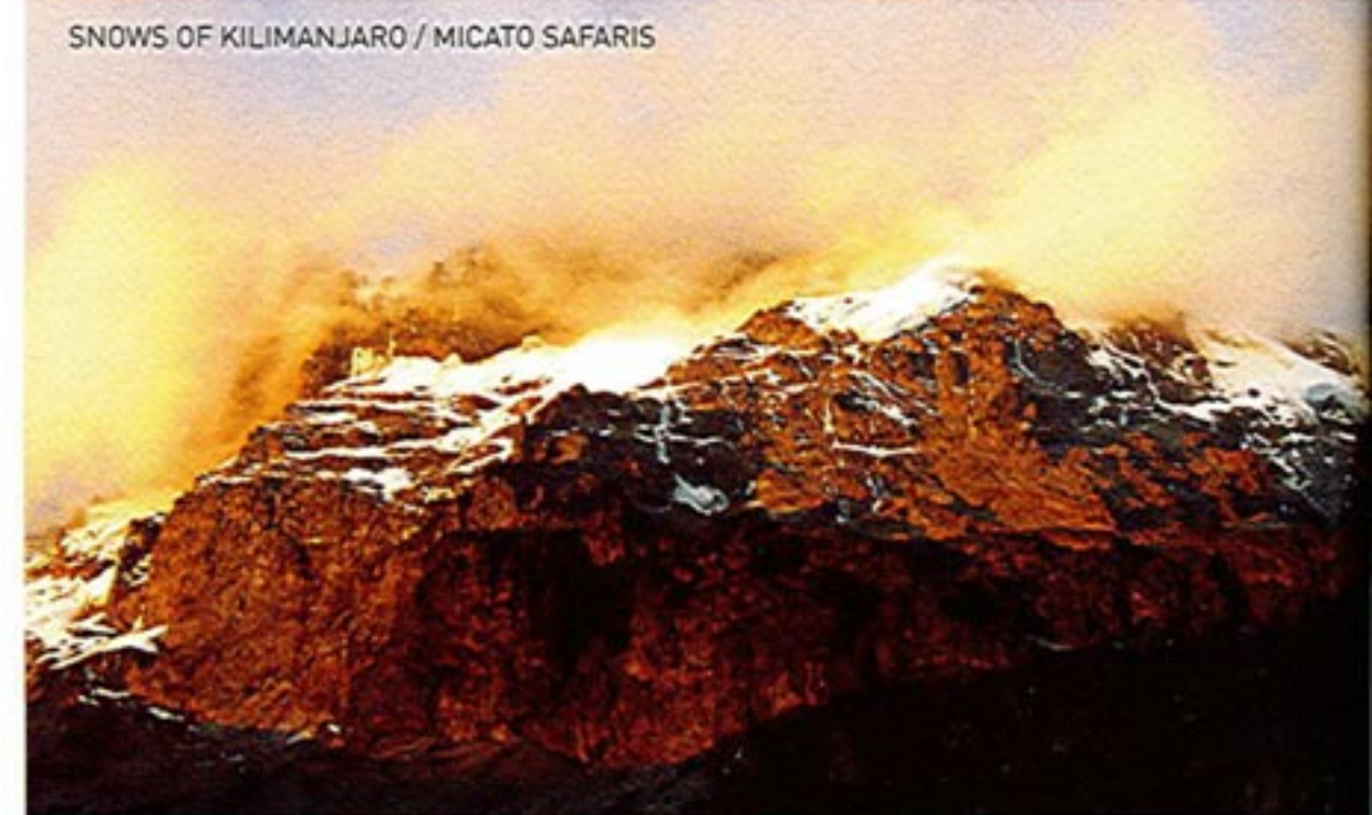
SNOWS OF KILIMANJARO / MICATO SAFARIS