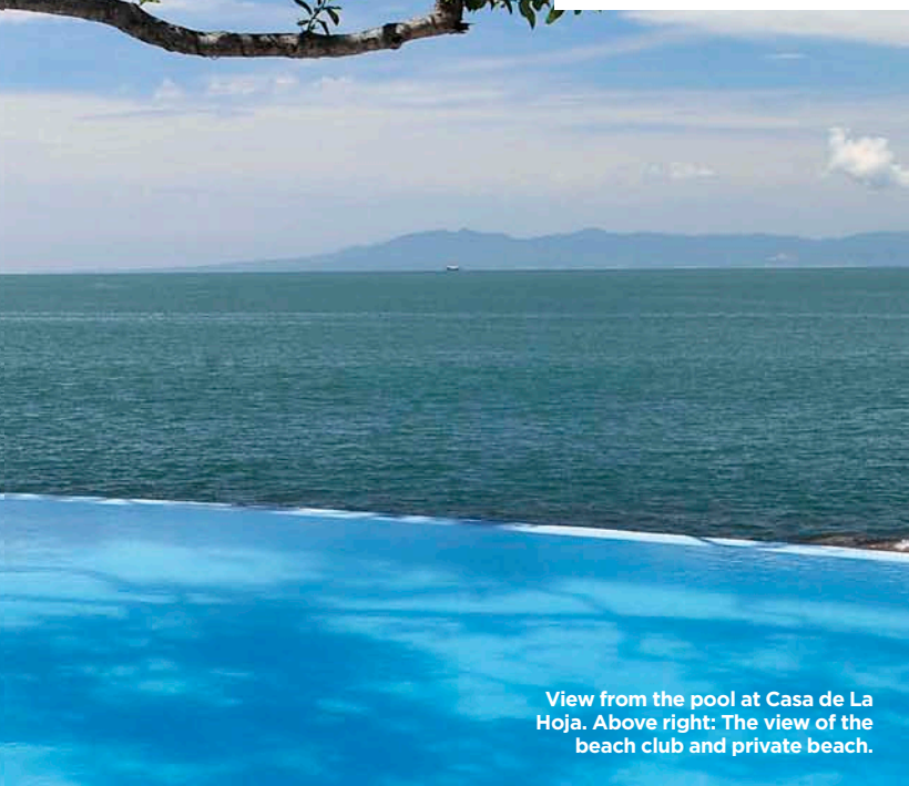
View from the pool at Casa de La Hoja. Above right: The view of the beach club and private beach.

PUERTO VALLARTA, MEXICO INCLUDES OVER 40 MILES of coastline and a diverse topography ranging from jungle dense with exotic tropical plants to steep mountain sides. Sitting on the edge of the last oceanfront site on Puerto Vallarta's historic south shore, El Paredón intertwines these natural elements with exquisite design to create luxury living for an exclusive few. ■ The development, comprising eight oceanfront and four oceanview homes, is nestled in Puerto Vallarta's Bahía de Banderas , the largest natural bay in Mexico and home to the area's most prestigious real estate. ■ Located a short distance from downtown Puerto Vallarta, the site originally allowed for a high-density project. However, upon actually seeing the location, the developers and architects, Elias Elias AR, fell in love with its natural beauty and preserving it became a top priority. The result: El Paredón, a community of 12 limited-edition estates inspired by the natural elements. ■ "We surveyed the property and planned the development with the habitat in mind,